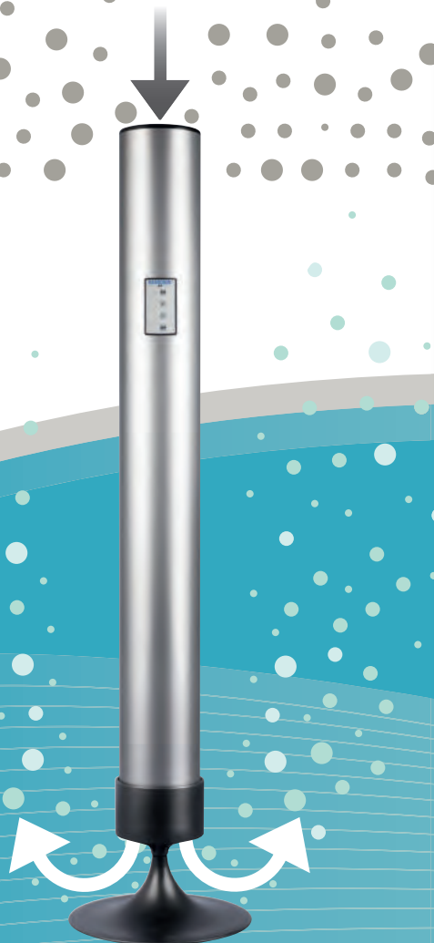
Diagram of air purification by NANODRON®

... and can give rise to allergies, headaches, chronic fatigue, frequent colds, diseases of the respiratory system and mucous membranes, dryness of the skin, nausea, dizziness, weakening of the immune system, failure of vital body functions and the central nervous system, congenital defects, etc. Children are often especially at risk from this constellation. Approximately every third illness can be attributed to the effects of polluted air!