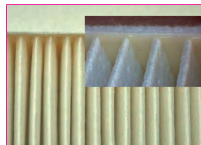
Fig. 3: Examples for embedding of the filter pleats into the layer of adhesive on the frame