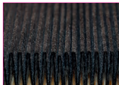
Fig. 1: Activated charcoal filter media pleated

To take full advantage of all positive characteristics of a modern adhesive, Jowat provides competent technical consultation to all customers in all phases of use of the products. From the provision of samples over the test phase to taking-in-to-operation of the machines, Jowat engineers are ready to supply help and advice.