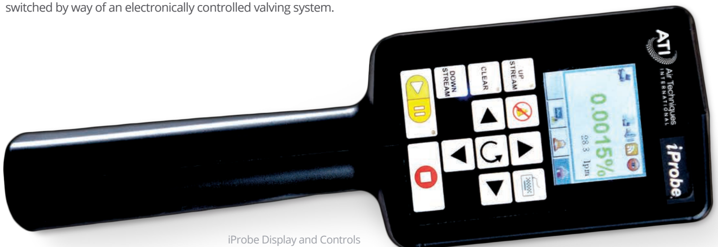
iProbe Display and Controls