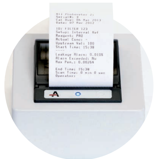
Optional Printer & Sample Report

The iProbe acts as an extension of the base instrument through a nearly identical user interface. All status and selection icons from the base unit are represented on the iProbe. With the press of a button, the sampling location can be remotely selected and switched by way of an electronically controlled valving system.