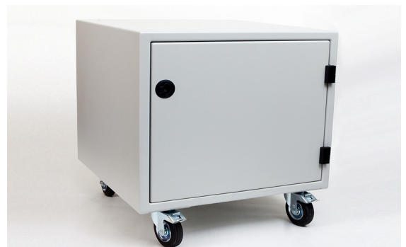
Base / Storage Cabinet

A large base cabinet, convenient for storing manuals and tools is available as an option. The cabinet is equipped with heavy duty locking swivel casters enabling the 100X to be easily moved wherever you need it.