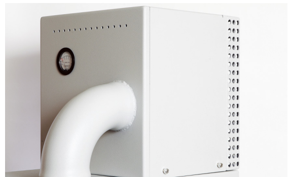
Local Exhaust Module

The 100X can be supplied with an optional local exhaust module to filter all aerosol exhaust when facility exhaust ducting is not available. The local exhaust module is designed with a convenient differential pressure gauge to help determine when to replace the internal HEPA filter.